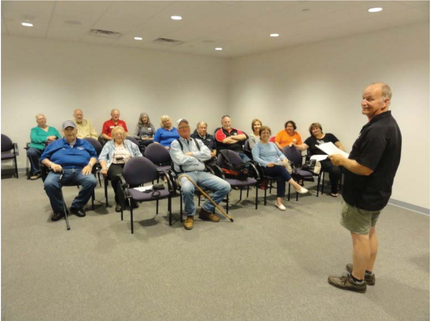
May Meeting Attendees

The regular meeting of the Corvette Club of Texas was held on May 20th at Friendly Chevrolet and with 16 people in attendance. Family events prevented a number of members from attending, including our secretary, so I will cover the minutes very briefly.