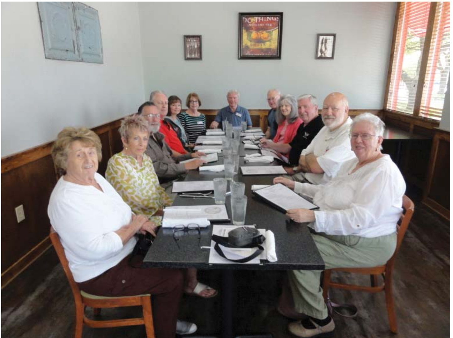
The 13 club members, not counting me, at the lunch

The specialty of the house was Pork Shank & Eggs. The pork shank had hollandaise sauce on it and there were two eggs any style. I choose scrambled eggs, potato hash with caramelized onions, two blueberry pancakes and I had a large tomato juice to drink. Counting the dinner after the club meeting the night before, I gained two pounds so there was plenty of food and it was very good.