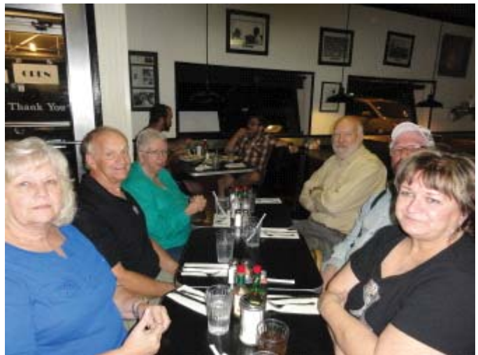
Dinner at the Original Market Diner after the Meeting