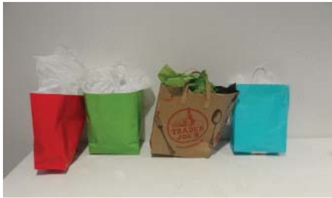
The Four Raffle Prizes