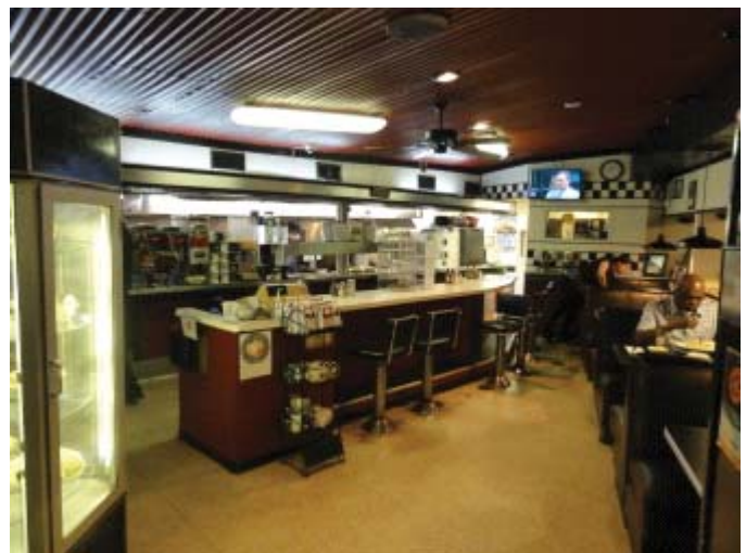
Original Market Diner