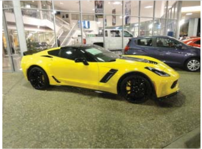
Beautiful Yellow 2016 Z06 Corvette For Sale at Friendly Chevrolet