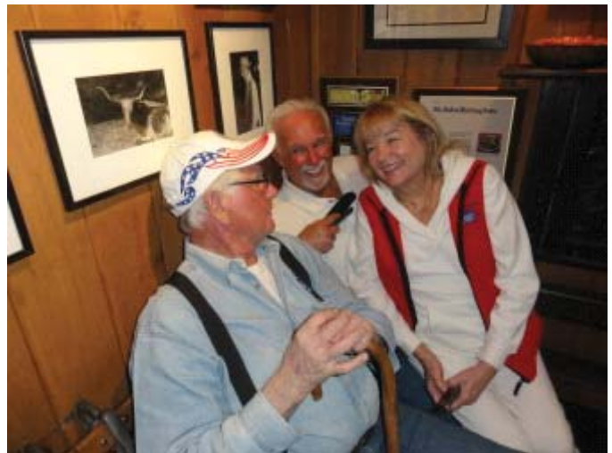
Waiting to be seated at Celebration