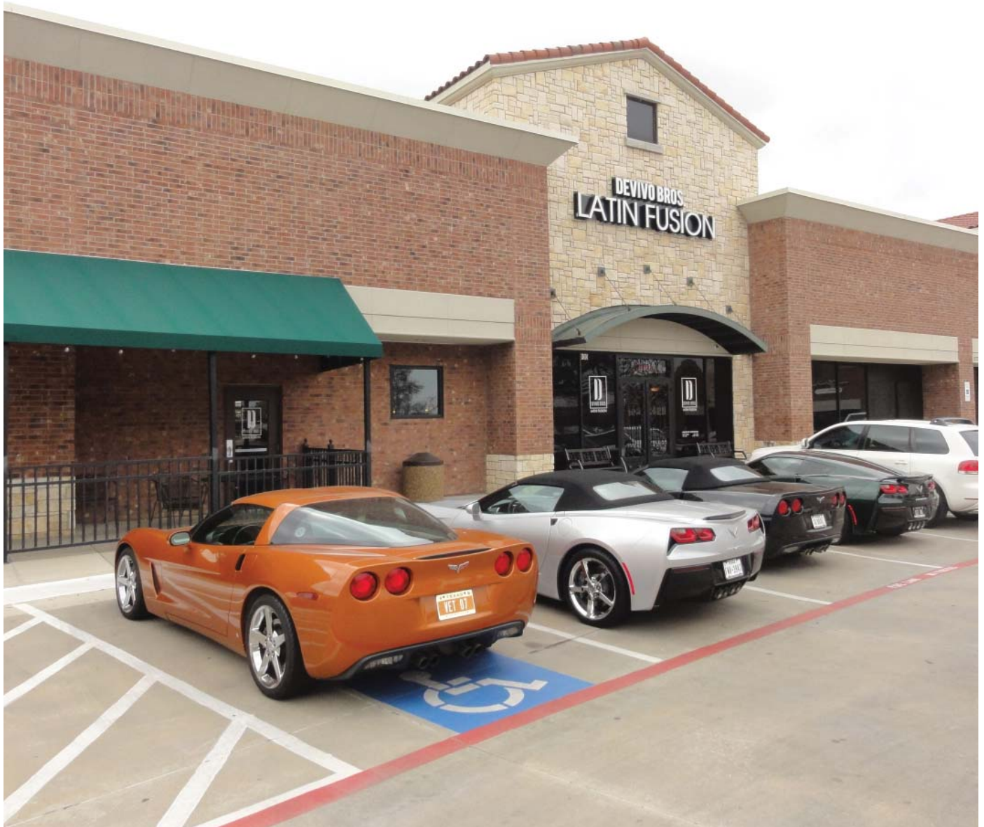
DeVivo Bros Latin Fusion in Southlake, Texas