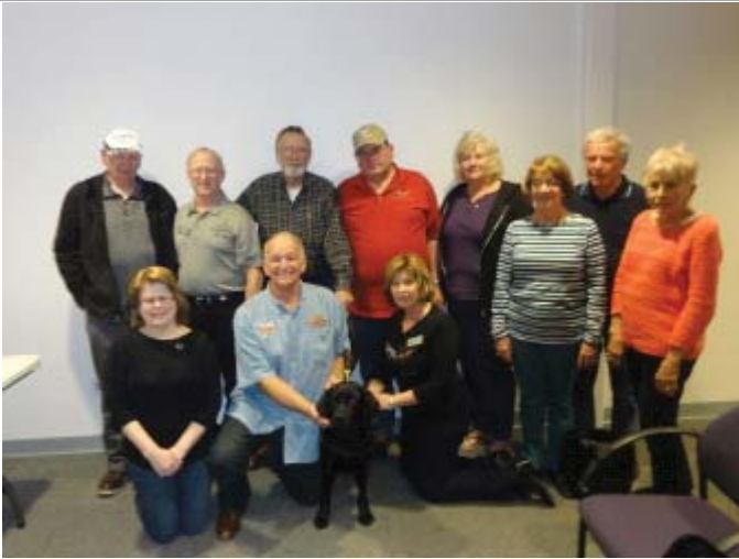
Mandy The Service Dog's Last Corvette Meeting