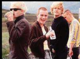
What my mom thinks I do