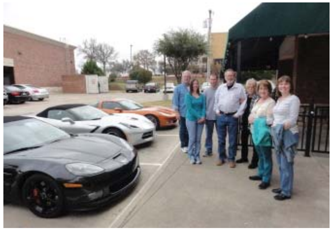
The Other Members and Their Corvettes