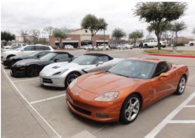
Just Pretty Corvettes