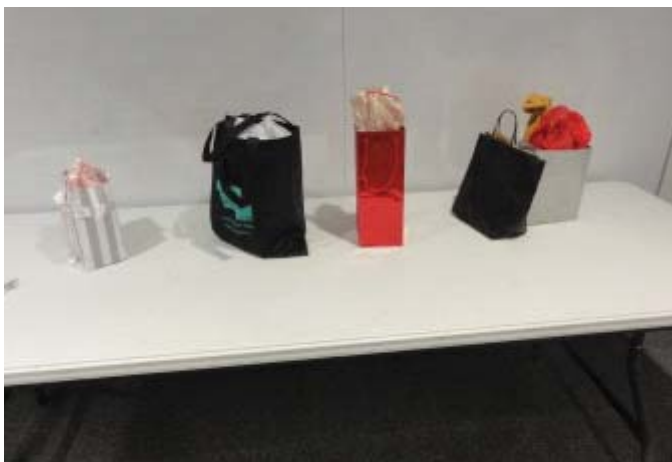
6 Raffle Prizes (One Hidden)