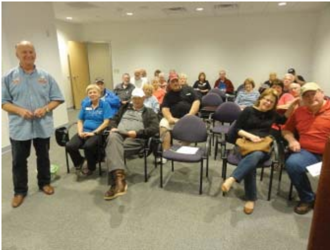
24 People at the Meeting