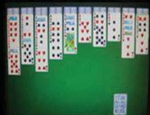
What I really do