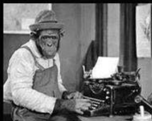
What publishers think I do