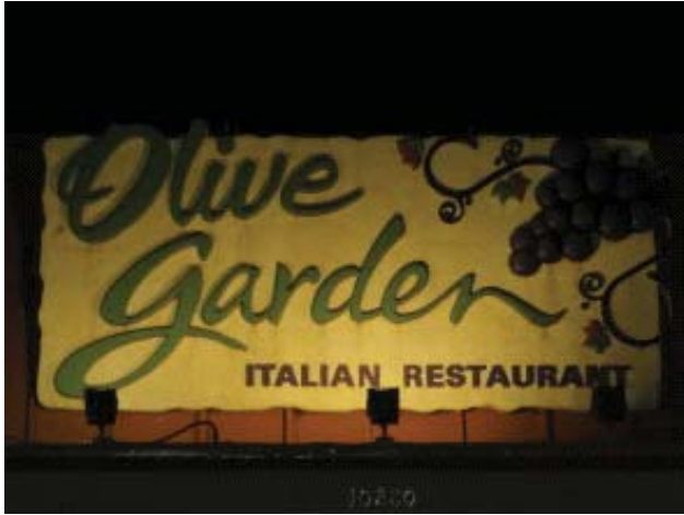
The Olive Garden