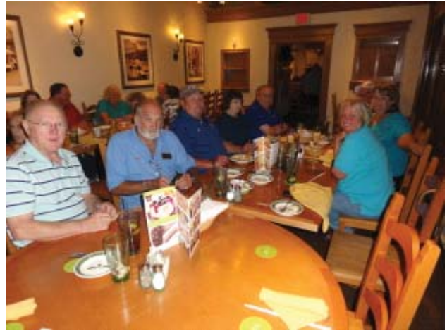
CCT Members at the Dinner