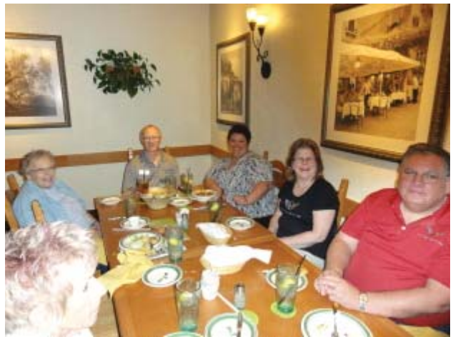
CCT Members at the Dinner