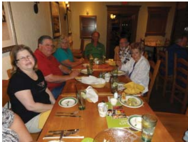
CCT Members at the Dinner