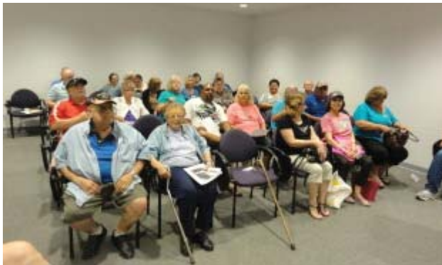
Club Meeting at Friendly Chevrolet

All of these efforts are what make out club such a nice organization. It takes a lot of work from a lot of people to run the club.