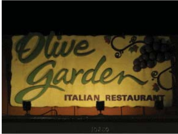
The Olive Garden