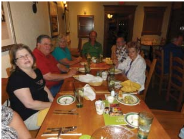
CCT Members at the Dinner