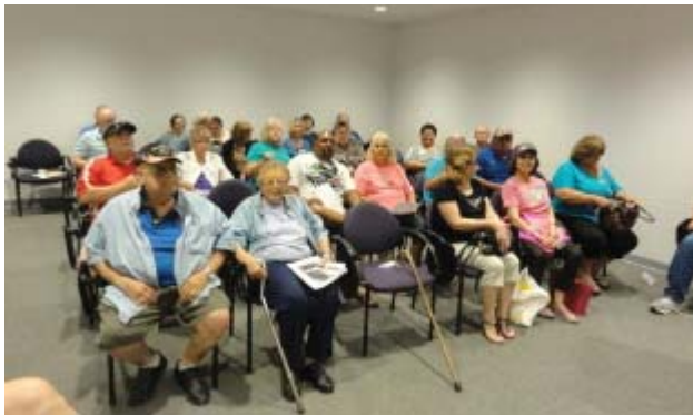
Club Meeting at Friendly Chevrolet

All of these efforts are what make out club such a nice organization. It takes a lot of work from a lot of people to run the club.