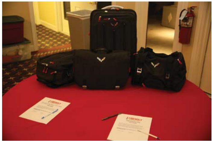
Friendly Chevrolet also donated a set of Corvette C7 luggage which was sold in a silent auction. The luggage is a $900 option when you buy your new C7 from Friendly.