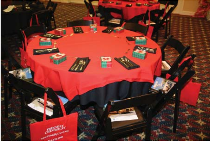
The table set ups were very pretty and had bags and calendars donated by Friendly Chevrolet. There were also tins full of some very good chocolates.