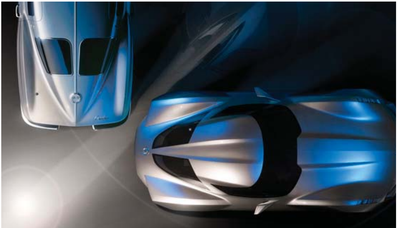
One more C7 a split window clone!