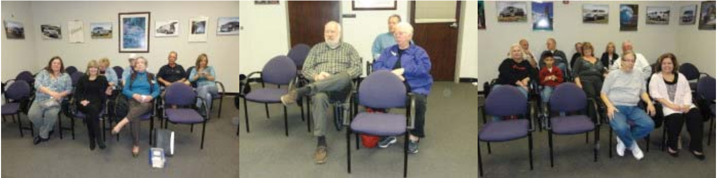
January Meeting Attendance