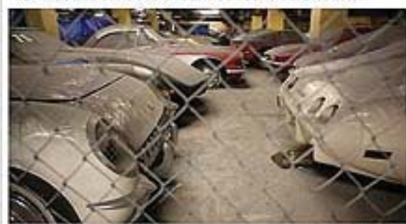
Vette Set: An Artist's Dream Collection Relocates

www.digitalcorvettes.com/forums/forumdisplay.php?f=171