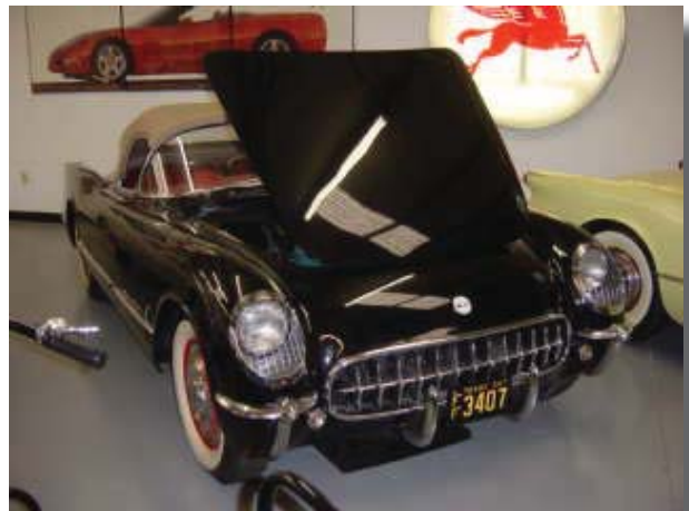
1954 Black Corvette Convertible

1956 marked the first change in styling for the Corvette with the addition of flashy coves on the sides with contrasting color that ran through 1962, but in 1962 the chrome strip around the cove was eliminated and you could get only a solid color. Look at the nice red 1962 Corvette and you will see the solid color.