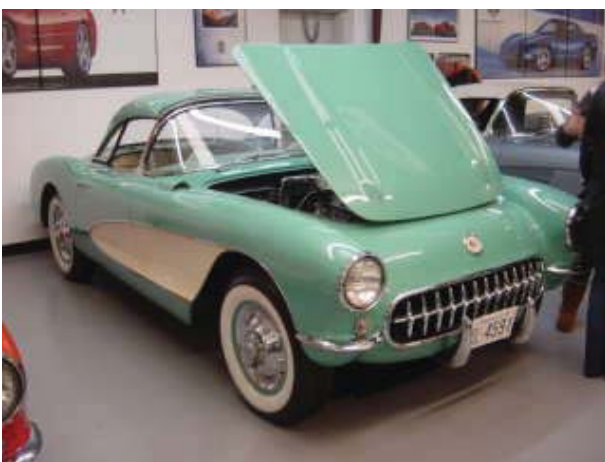
1957 Cascade Green & White Corvette Convertible

1957, the year that I graduated from high school, was the last year for just two headlights and you can see the quad-headlights on the pretty silver blue 1958 Corvette with the louvered hood