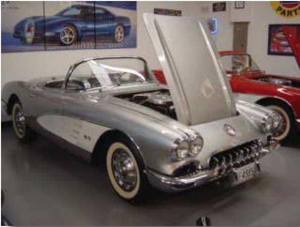
1959 "Inca Silver" & White Cove Convertible

One of the things to note is that all of the Corvettes so far were convertibles. Wow! It brings back memories of cruising in a convertible with your girl friend, going to the drive-in restaurants and to the drive-in movies. Those were the good old days.