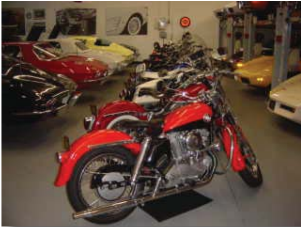
Many Years of H-D Motorcycles