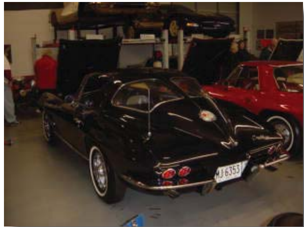
1963 "Tuxedo Black" "Split Window" Corvette

The C2 generation of Corvettes ran from 1963 through 1967 so it was a fairly short run, but it was the envy of every high school boy to get a 1967 Corvette convertible with a high-horse power big-block engine. My son wanted one, but they were selling for $100,000 at the time and college was going to be expensive so I got him a Mustang.