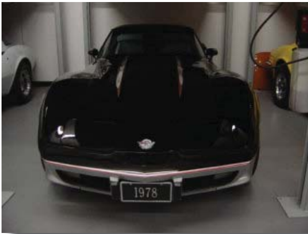
1978 Black & Silver Corvette L48 Pace Car