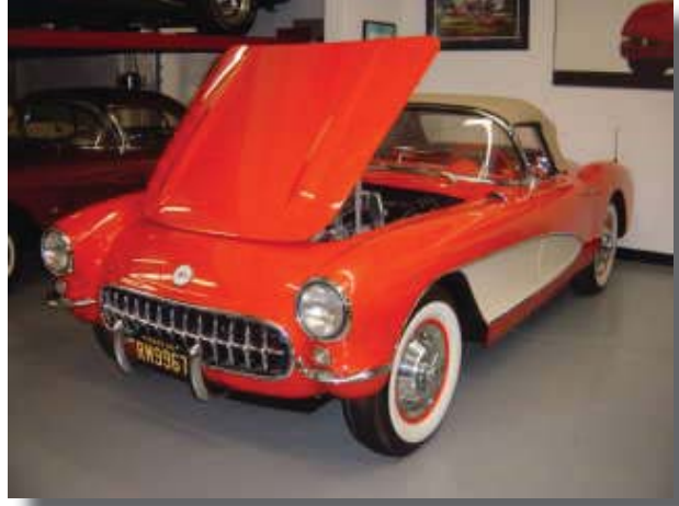
1956 Red & White Corvette Convertible

1957, the year that I graduated from high school, was the last year for just two headlights and you can see the quad-headlights on the pretty silver blue 1958 Corvette with the louvered hood