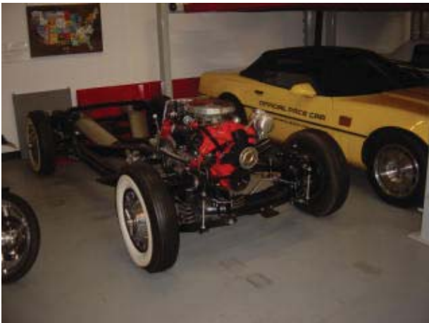
1961 Corvette Chassis and Engine

Everyone always wants to know how a Corvette is built and Tony has assembled or disassembled a 1961 Corvette to show people just how they fit together. Only a few bolts hold the body to the chassis, but there are a lot of wires, tubes and etc. so it is not an easy job to take one apart and put it back together. I think that you have to leave the steering wheel off of the chassis until the body is on and then put the steering wheel on inside the car.