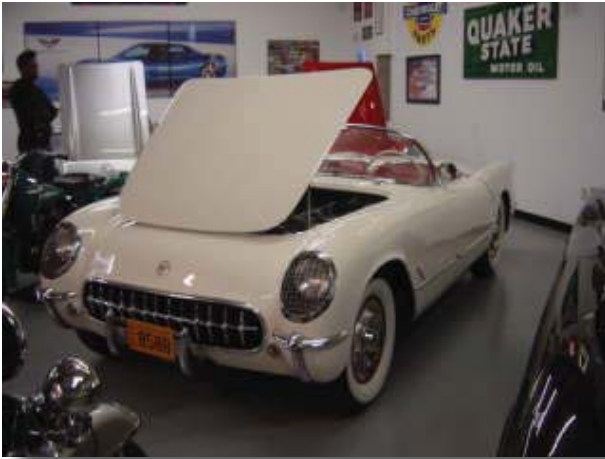
1953 White Corvette Convertible