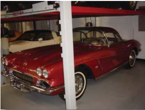
1962 "Roman Red" Solid-Color Corvette