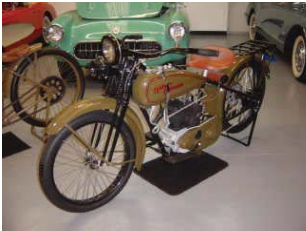
1926 Harley-Davidson Motorcycle