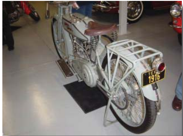
1916 Harley-Davidson Motorcycle