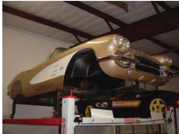
1961 Corvette Convertible Body

The "last and the first" happened next with the last Corvette convertible in 1962 with no side cove and one color paint. It also marked the end of the C1 generation of Corvette also known as the "solid axles" cars. The second generation of Corvettes known as the C2 started in 1963 with the first coupe known as the '63 "split window." It seemed that there was a problem producing a one-piece glass rear window and I have never understood that because they were making curved window shields, but there was a post in the center of the rear window in all of the coupes. A lot of owners disliked the post either for appearance or for safety of better rear visibility, but I don't think many Corvette drivers spend much time looking behind them. So a lot of them were modified to remove the post only to find out a few years later that the '63 "split window" was a much sought after car and they started putting the post back in some of the cars so they would be more valuable. The 1963 Corvette marked the beginning of the first major design change that would be known as the C2 Corvette with independent rear suspension. Oh, there was also a convertible available in 1963 so don't panic.