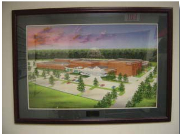
Museum Master Plan