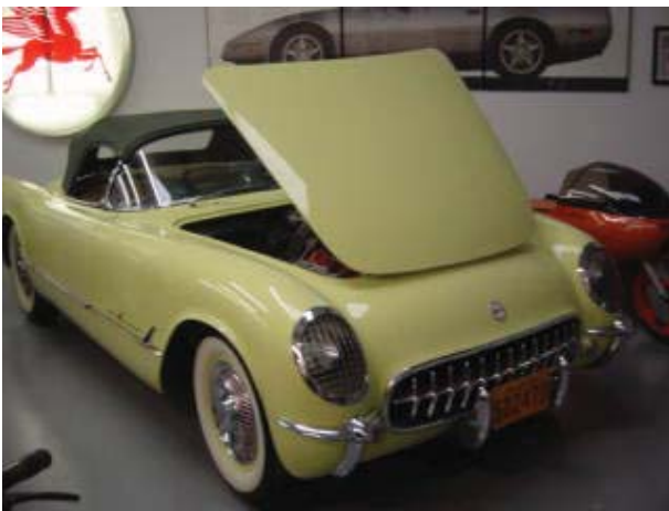
1955 Yellow V8 "CorVette" Convertible

1956 marked the first change in styling for the Corvette with the addition of flashy coves on the sides with contrasting color that ran through 1962, but in 1962 the chrome strip around the cove was eliminated and you could get only a solid color. Look at the nice red 1962 Corvette and you will see the solid color.