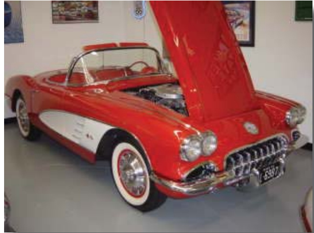
1960 "Roman Red" with White Cove Convertible

Everyone always wants to know how a Corvette is built and Tony has assembled or disassembled a 1961 Corvette to show people just how they fit together. Only a few bolts hold the body to the chassis, but there are a lot of wires, tubes and etc. so it is not an easy job to take one apart and put it back together. I think that you have to leave the steering wheel off of the chassis until the body is on and then put the steering wheel on inside the car.