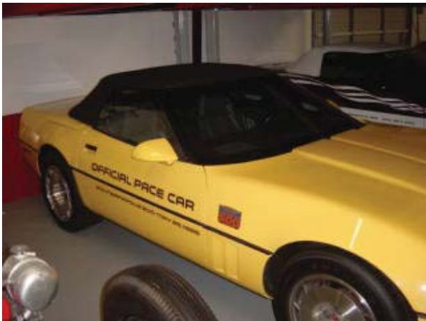
1986 Corvette Pace Car