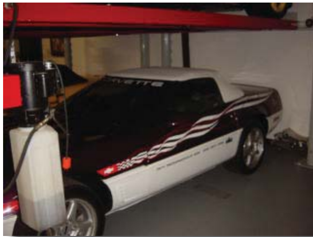
1995 Corvette Pace Car