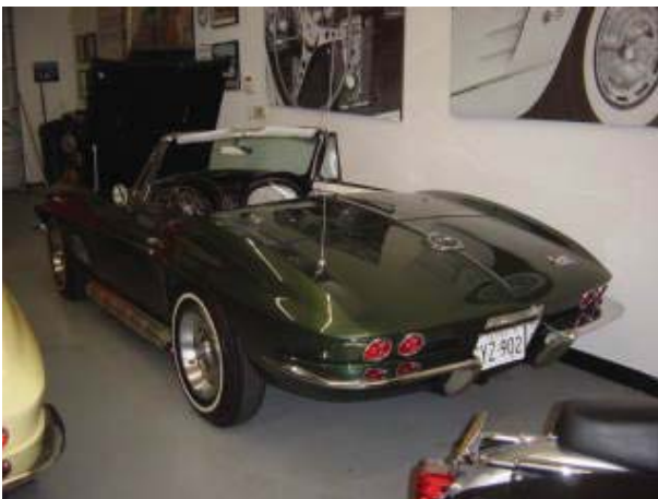
1967 "Goodwood Green" Convertible

So 1967 was the end of the C2 generation and the 1968 started the C3 generation of Corvettes. I am going to skip a lot of the photographs that I took partly to reduce the length of this article and also because most of Tony's C3 Corvettes were on top of or under hydraulic lifts and my photographs don't look so good. I did include a photograph of a 1973 Corvette because it marked the start of a change in appearance. A new safety required a 5-mile per hour front bumper that would protect the functional parts of the car in a low speed crash; however, it did not protect it from an expensive repair job. The 1973 Corvette is the only Corvette with a soft front bumper and an old style hard chrome steel rear bumper know as "a soft nose and a hard tail." I'm not responsible for that expression, it is just there in Corvette history.