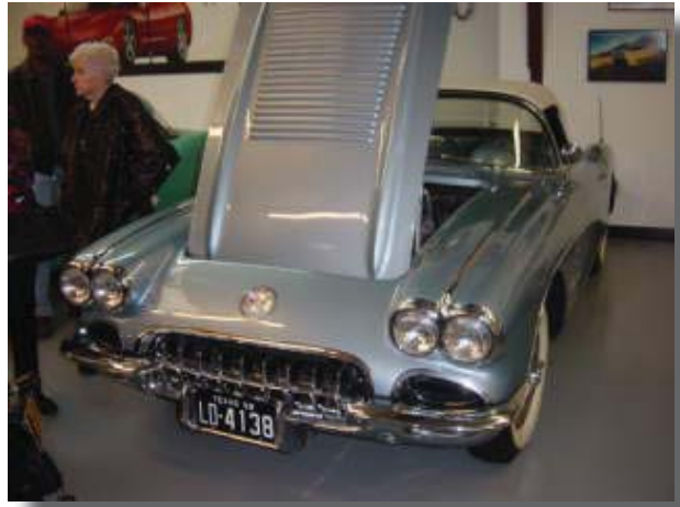
1958 Silver Blue Corvette Convertible