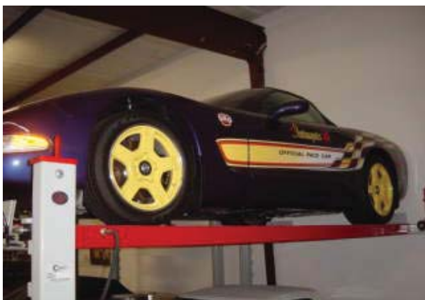
1998 Corvette Pace Car