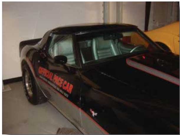
Official Pace Car