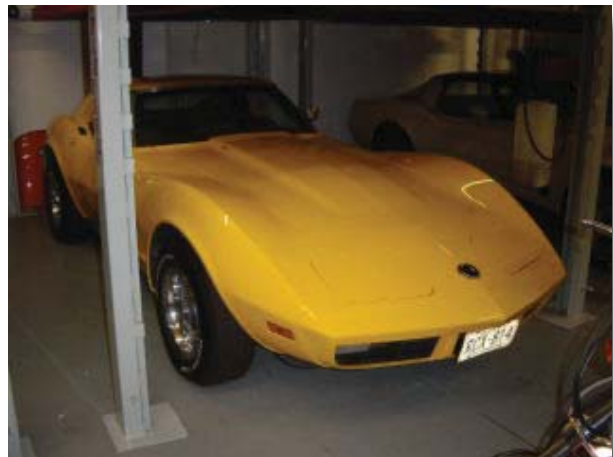
1973 Yellow Corvette

The next Corvette, the 1978 Corvette Pace Car is near and dear to my heart since I own and drive one and I love it and regardless of what other people say. I believe that it looks the best of all Corvettes, drives the nicest, handles extremely ---, has a lot of power under the hood and is very comfortable in the hot summer with its super air conditioner. Tony's pace car only has 400 miles on it so it isn't really broken in yet while my well-seasoned pace car has just over 100,000 miles and runs great, at least most of the time. Anyway it was good to look at his and see some of the things that I need to do to my car. I will never forget driving my Corvette pace car across the finish line at the Indianapolis Motor Speedway also known as the "brick yard" and getting my official photograph taken at the blazing speed of 13 mph. It was a slow day.