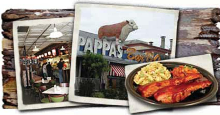
Pappas Bar-B-Q

After the meeting we caravanned to Pappas Bar-B-Q which is the default dinner place when no one plans a special dinner. We had three double table of members at the dinner and from what I saw no one went hungry. I counted a total of 15 people at the dinner and we had some great time bonding and discussing.