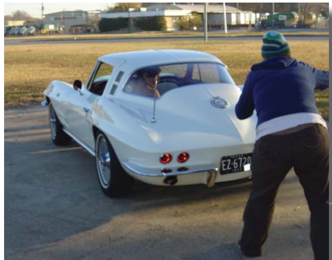
Photographer taking a rear shot with model looking to rear