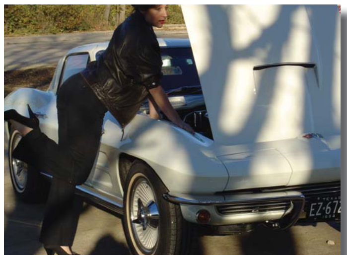
Shot of model taking advantage of the 365 hp engine heat