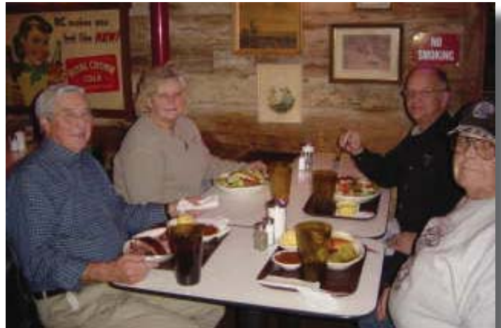
CCT Members at Pappas Bar-B-Q