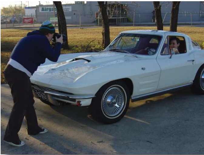
Photographer taking a front shot with model inside

Immediately after completing this photo session, the model was off to Atlanta, Georgia for another photo session.