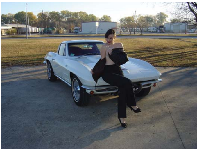
Front shot of model posing on front of car