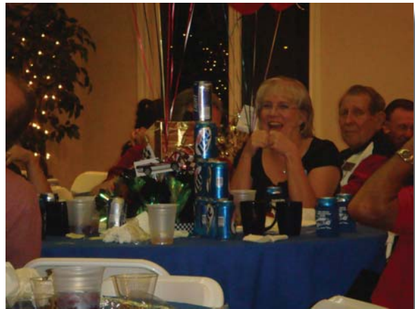
Some folks had more fun at the 50th party than others. Check out the can pyramid...