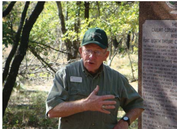
This was our guide at the Nature Center. I don't think it was possible to get a picture where he wasn't talking... But that's OK because he was very knowledgeable and interesting.