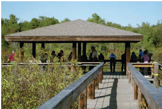
CCT checking out the view at the Fort Worth Nature Center.