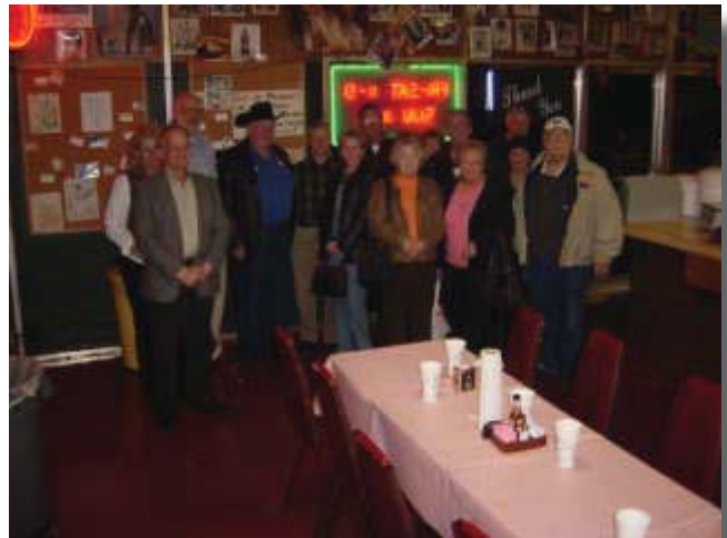
And the Corvette Club