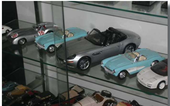
There were very few Corvette models. A pair of blue C1s...