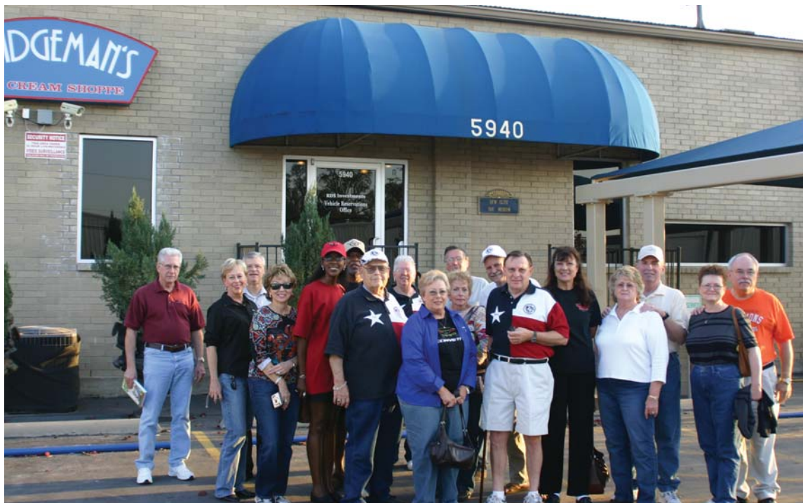
The whole crew.