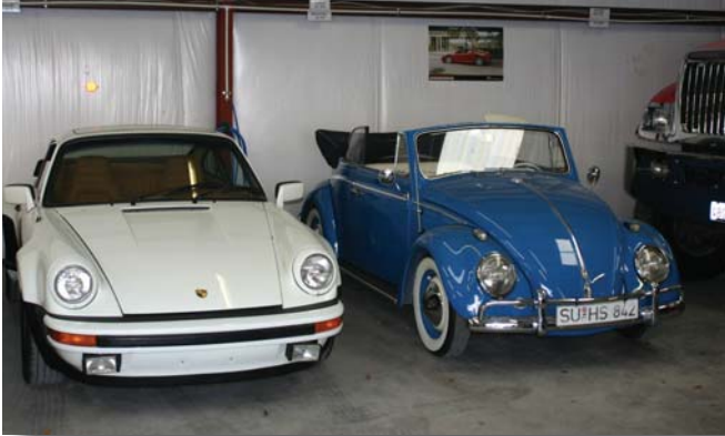
Not all the rentals are "exotic"