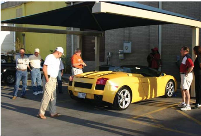
Parked out front, we drool over a nice Lamborghini