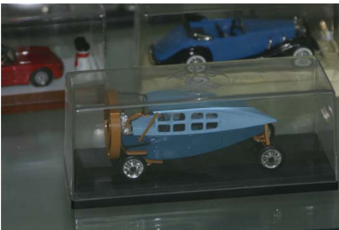
I know a lot about cars but I've never seen one like this...