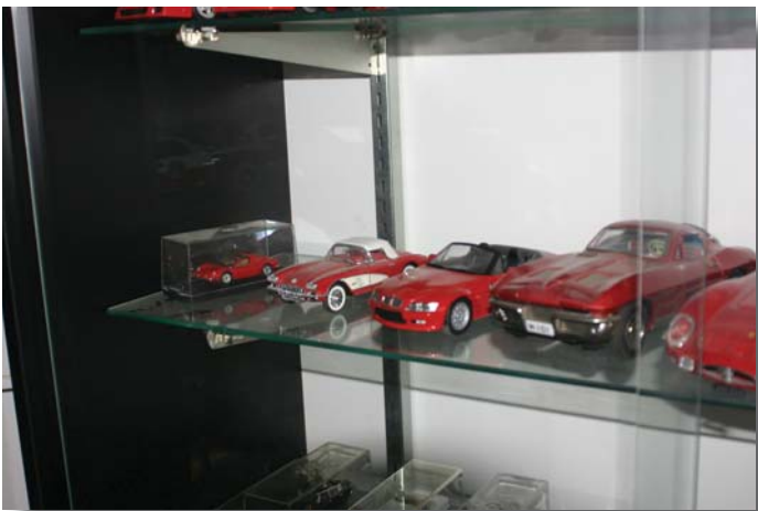
...and another C1 and a C3. Most of the collection is German, especially Mercedes.