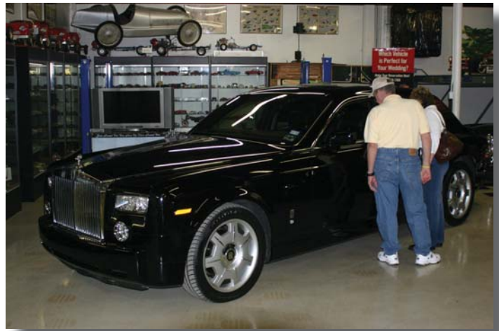
First thing you see inside is a very nice Rolls. Only $3000/day and you can take on a cruise