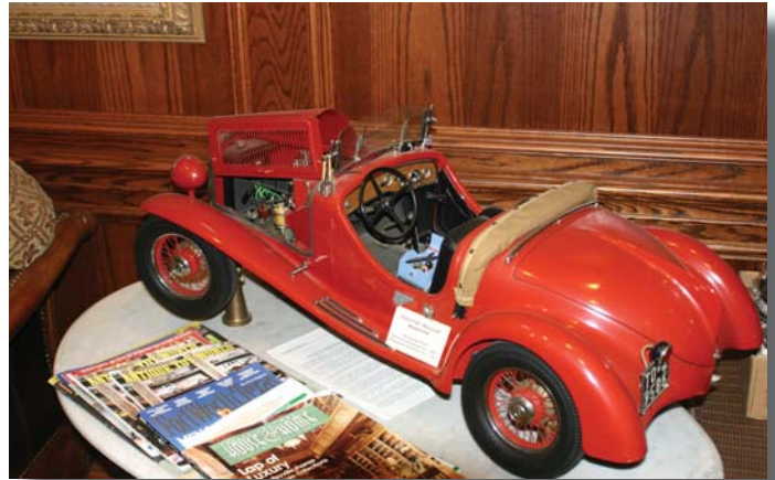
Some of the models were amazing