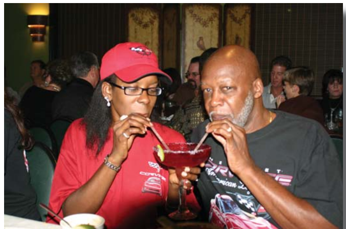
Later we have a good time at Oscar's